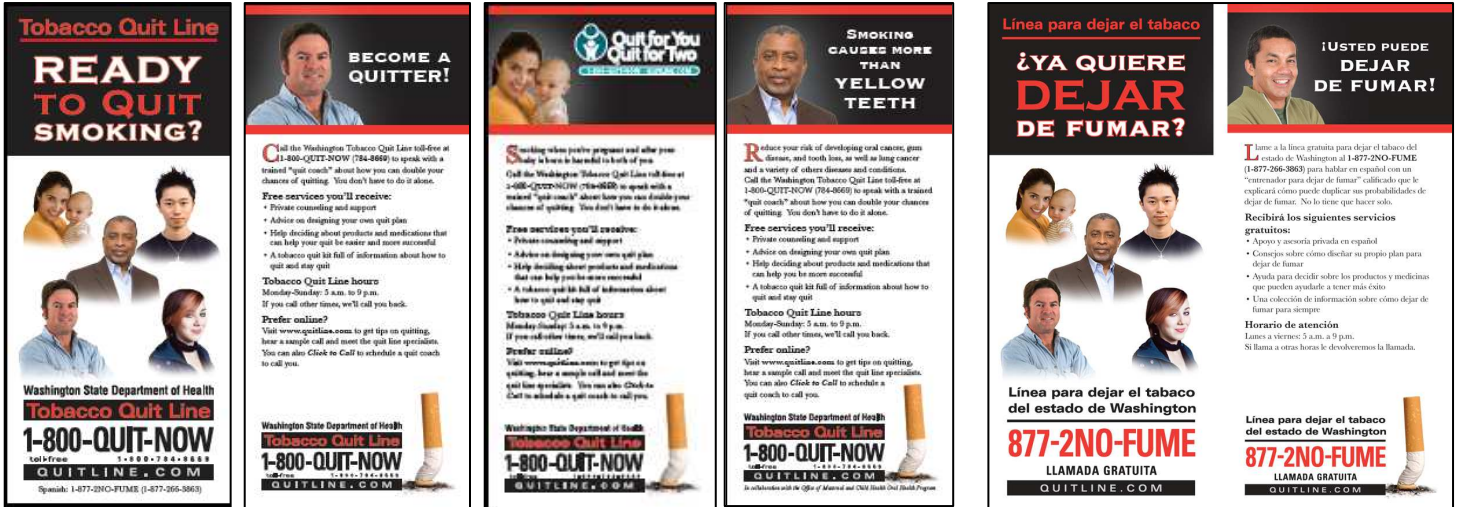
(General Brochure, Pregnant Women Brochure, Dental Brochure, Spanish Brochure)